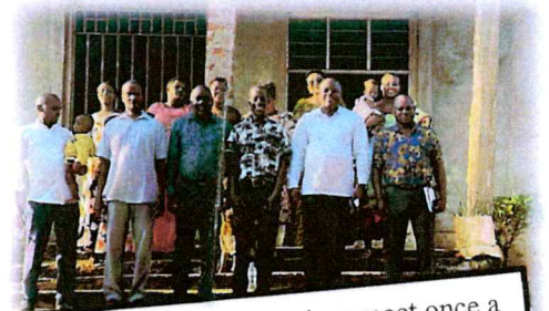
Our pastors & their wives meet once a month for Bible Study & Fellowship!